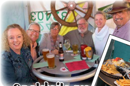
Cocktails on the Cape