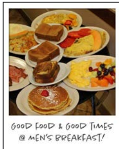
GOOD FOOD & GOOD TIMES @ MEN'S BREAKFAST!