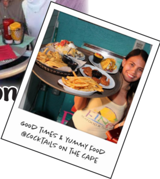
GOOD TIMES & YUMMY FOOD @ COCKTAILS ON THE CAPE