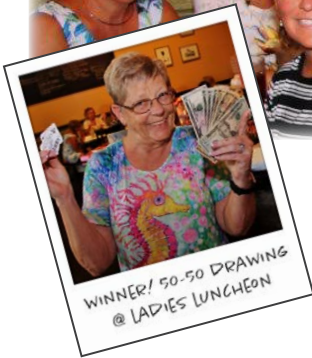
WINNER! 50-50 DRAWING @ LADIES LUNCHEON