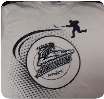
Free Tee Shirt! Select size (Med/Large/Xlarge) at checkout

Extra cost Parking $10/vehicle (an additional $2 service fee for online sign-up or credit cards)