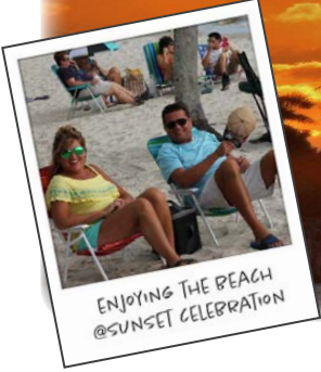
ENJOYING THE BEACH @ SUNSET CELEBRATION