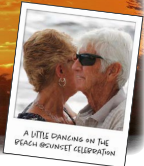
A LITTLE DANCING ON THE BEACH @ SUNSET CELEBRATION