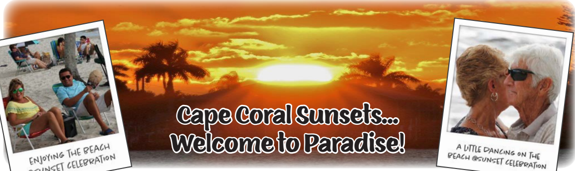
Cape Coral Sunsets... Welcome to Paradise!