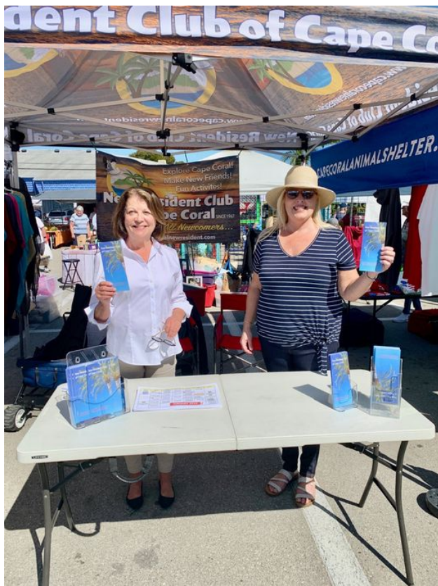
Publicity at Saturday Market by Sunset Drinkers