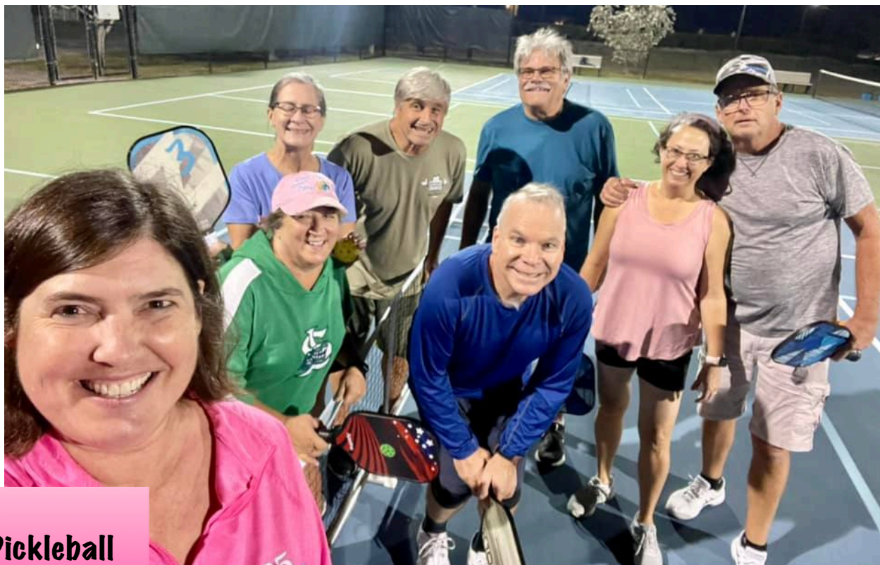
Beginners Pickleball February 3