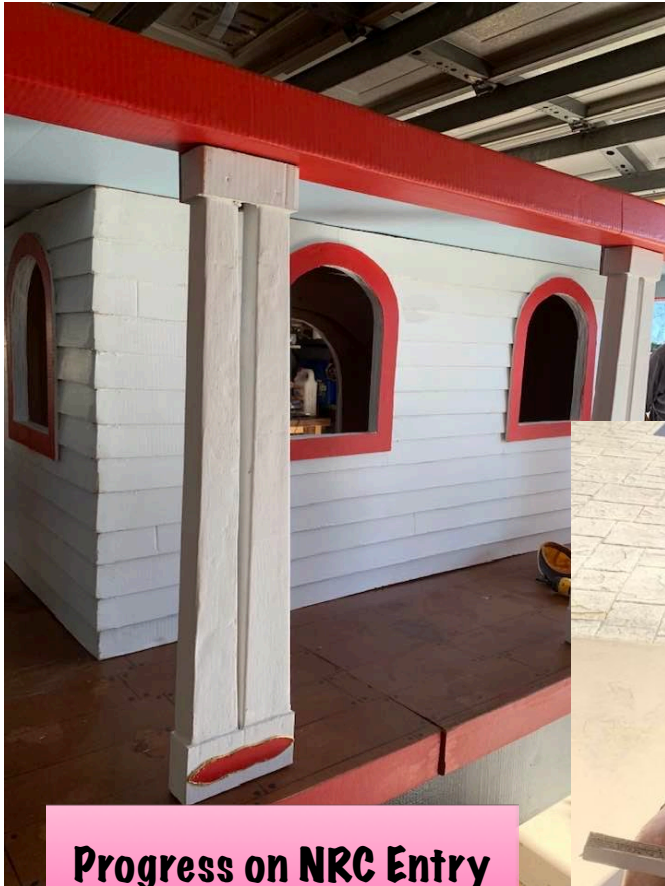
Progress on NRC Entry for Cardboard Boat Regatta