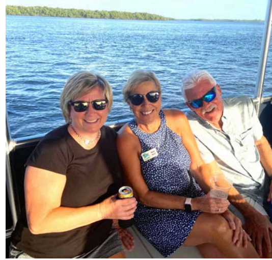
June Sunset Dolphin Cruise