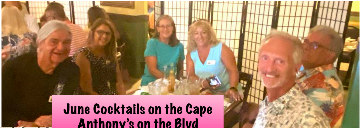
June Cocktails on the Cape Anthony's on the Blvd