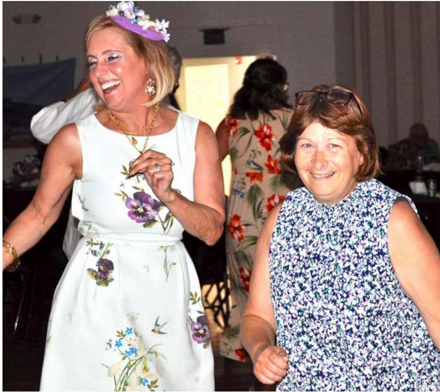
June Dinner Dance A Night at the Horse Races Lake Kennedy Center