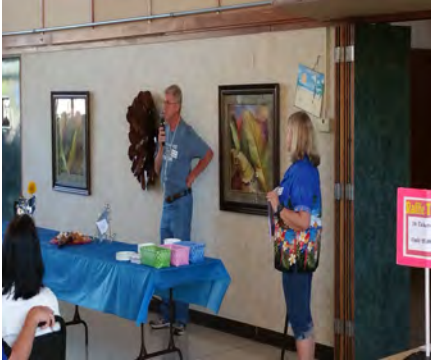
SPEAKER: ON BOATING INFORMATION