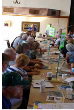
SPEAKER: EMERGENCY PREPAREDNESS