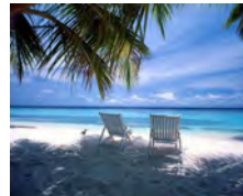
Nov/Dec 2014 BEACH BRATZ Reporter: Babz Maxell