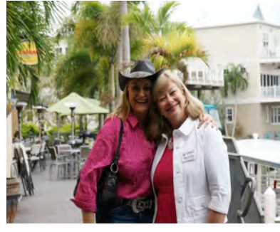
LADIES LUNCHEON AND RAFFLE