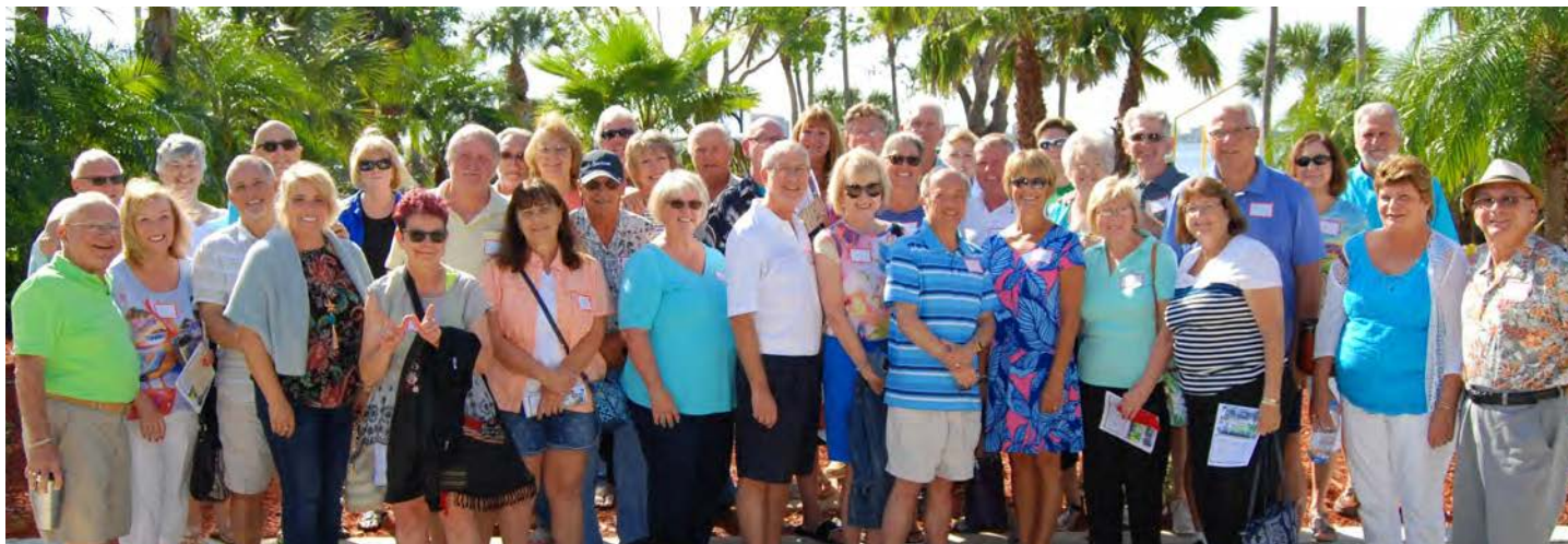
We welcome the "Mixed Nuts," our February Group. All 75 of them!