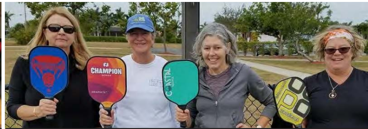
Either Pickleball players or corporal punishment advocates.