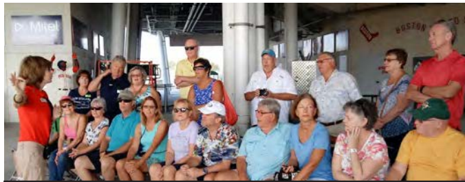
Learning the secrets of Jet Blue Park.