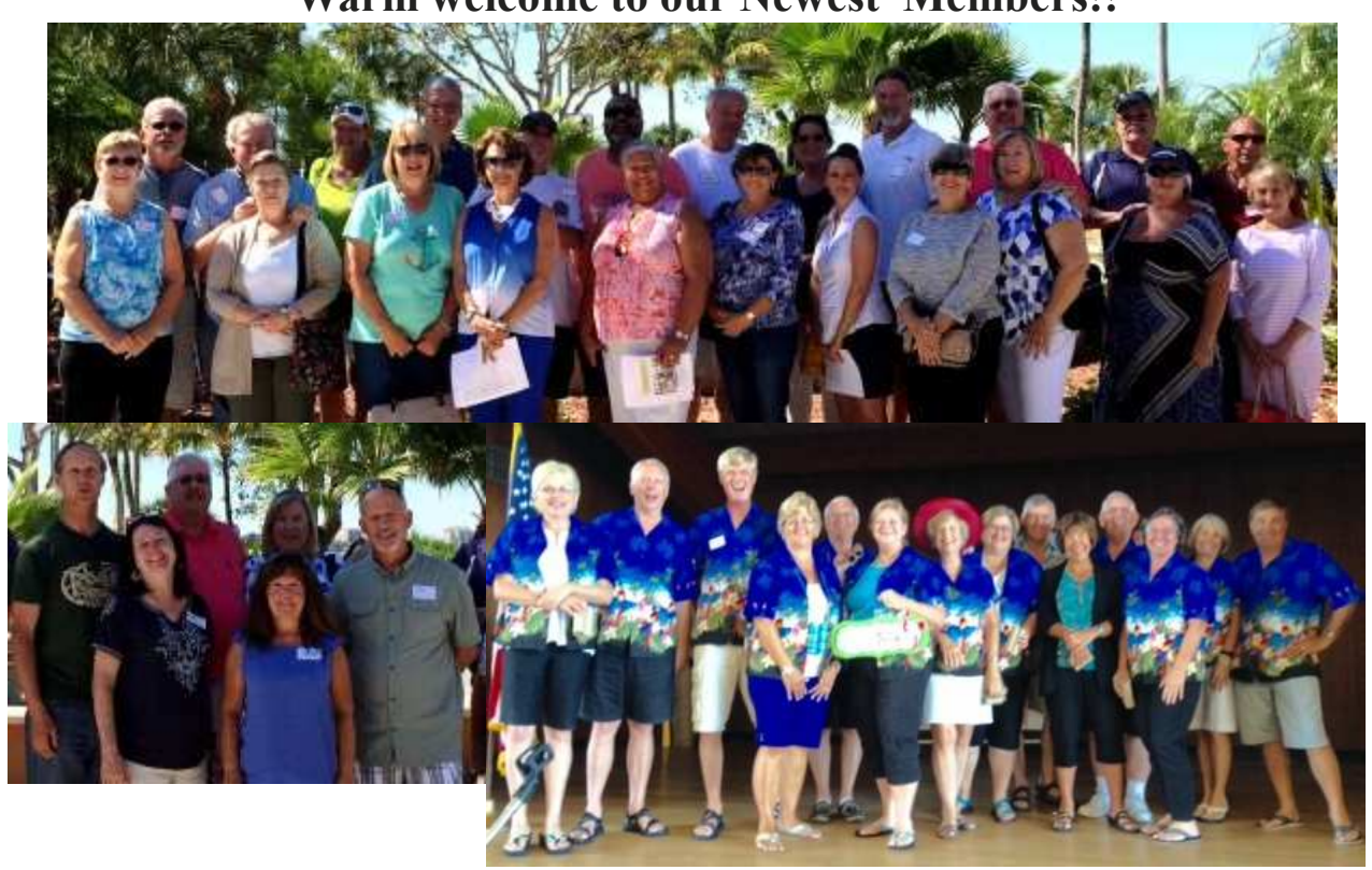
Congrats to Graduates Paradise Found March/April 2014!!